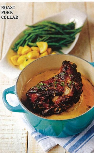
ROAST PORK COLLAR

a clean whiteness. Biting into the luscious, tender flesh accented by a slight milky flavour, we swoon. There's also a sauce boat of Madeira gravy, but I find that the meat tastes best on its own, thanks to the subtle flavours imparted by the garlic and rosemary, which are stuffed into the chicken.